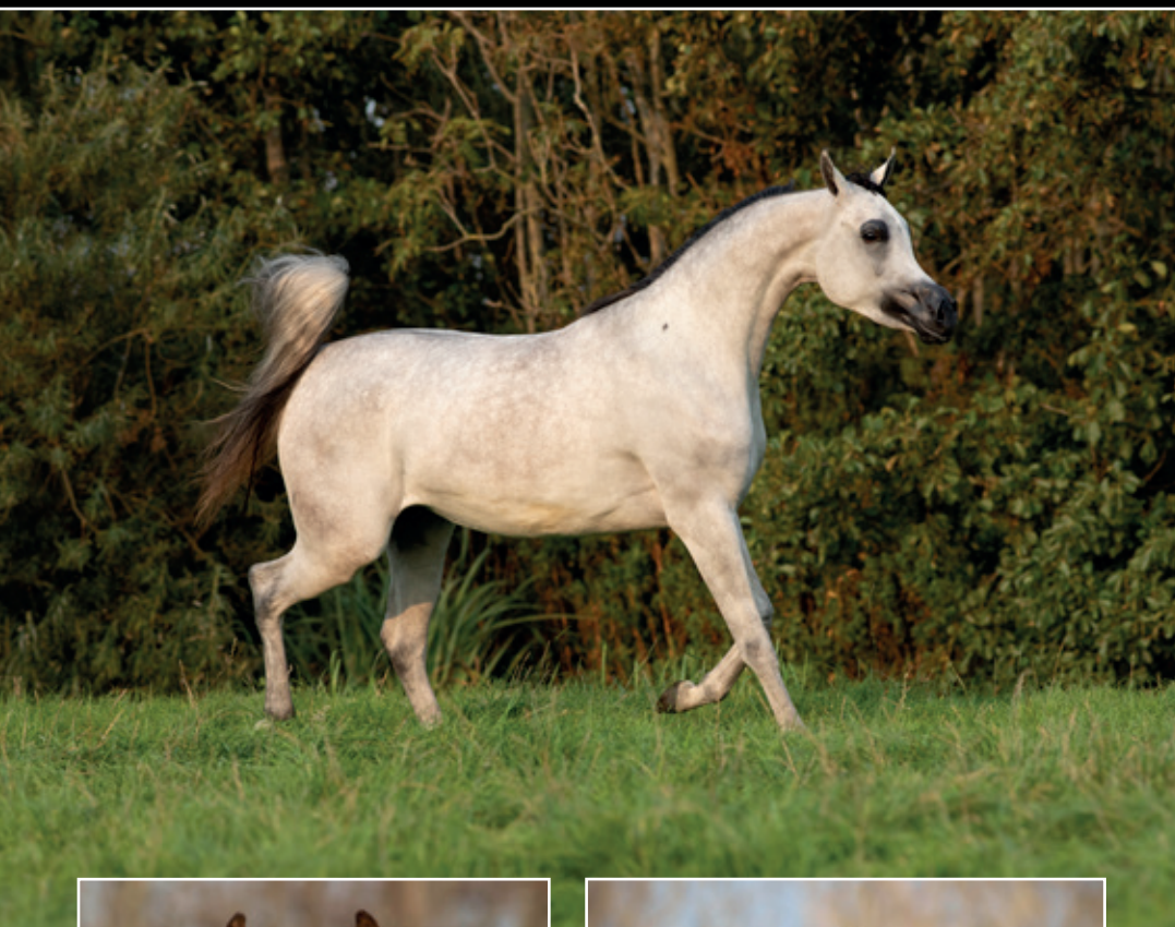
SILVER STARLIGHT BJ