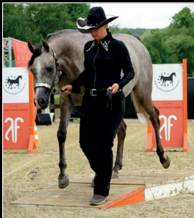
FORELOCK'S VERMILION AJ Dinar x Valeta F

The colt, Forelock's Yaell, was already striking as a foal. Inherited the best of both his sire and his dam, Yaell is living up to all the expectation. With his incredible attitude and beautiful large eyes, he is one they are keeping as their future show- and breeding stallion. This year he will be trained at the farm for the upcoming