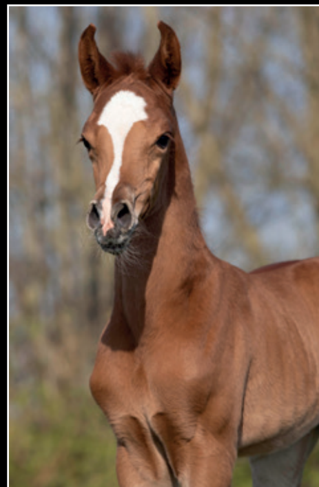
FORELOCK'S YA' ELLE